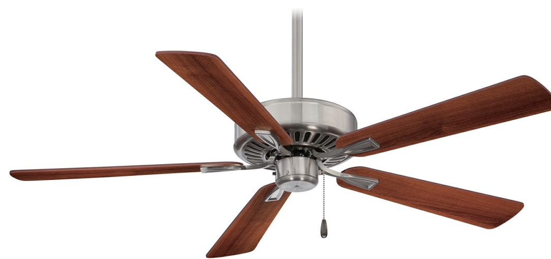
Shown with Reversible Dark Walnut Blades

Item # F556-BN/DW UPC Code: 706411052507 Product Family Name: Contractor Plus Finish: Brushed Nickel with Dark Walnut Category: INTERIOR FAN Blades Certification 4000048 Category Type: Ceiling Fan Patents: Notes: